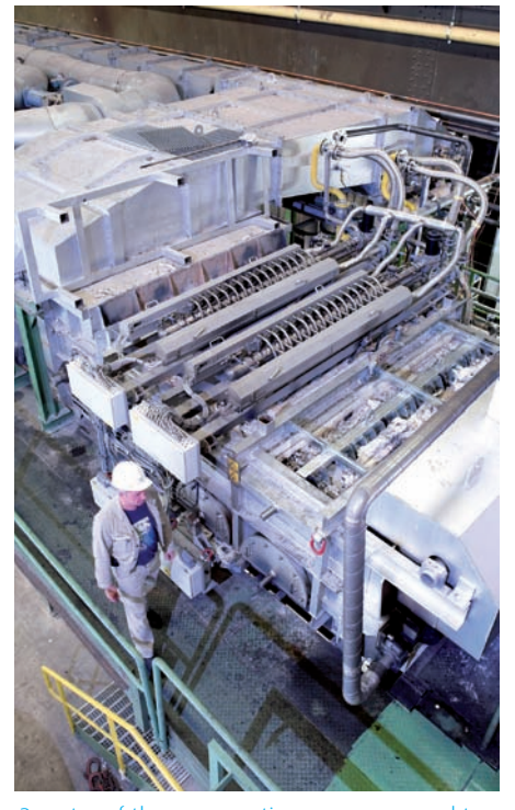
3 meter of the recuperative zone was used to fit the compact DFI oxyfuel unit.

Direct Flame Impingement oxyfuel is one of the leading solutions within the REBOX® portfolio. The broad REBOX® technology and application experience drives the development work and results in fast and safe project handling. We provide turnkey installations with guaranteed performance.