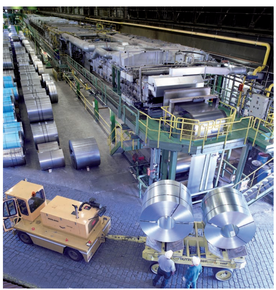
DFI oxyfuel for implementation in existing galvanizing line, at ThyssenKrupp Steel, Finnentrop, Germany, 2006.